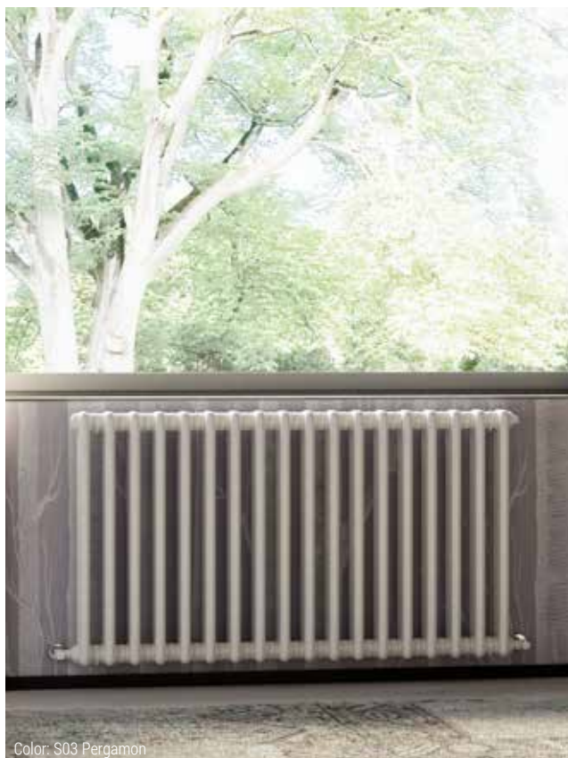
Color: S03 Pergamon